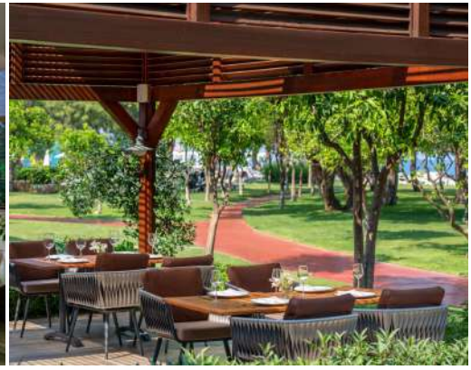
A la Carte Restaurants (5)