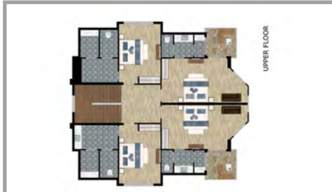
GROUND FLOOR SKETCH