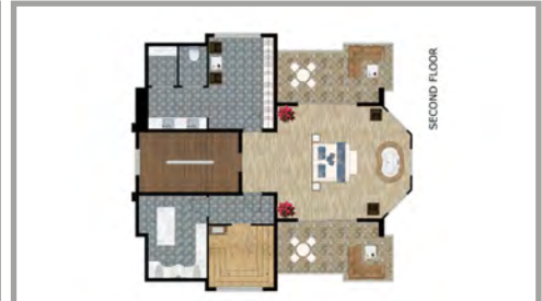
UPPER FLOOR SKETCH