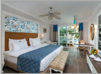
DELUXE POOL ROOM