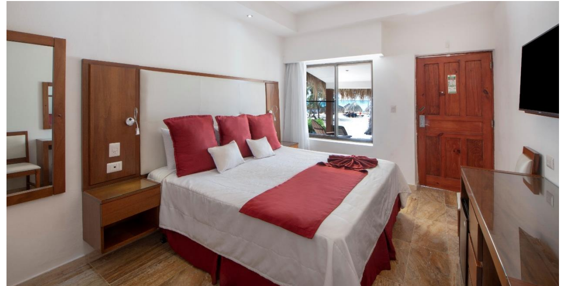
Ocean Front Bungalows