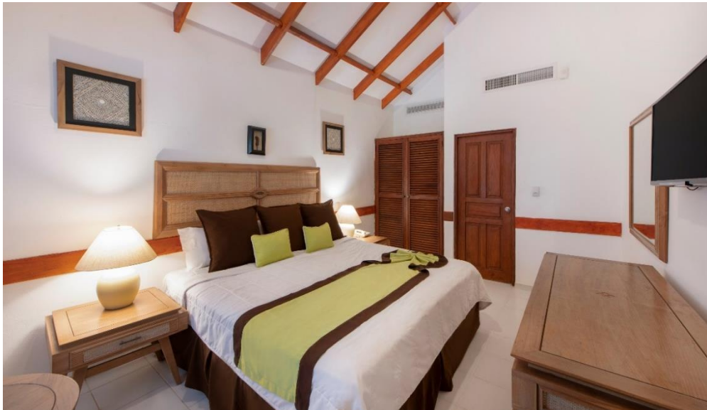
Garden View Bungalows