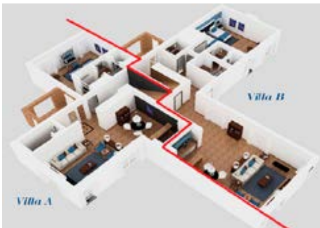
AZURE Villas / 3 bedrooms / Ground Floor