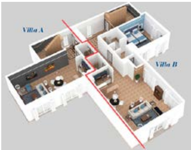
AZURE Villas / 2 bedrooms / Ground Floor