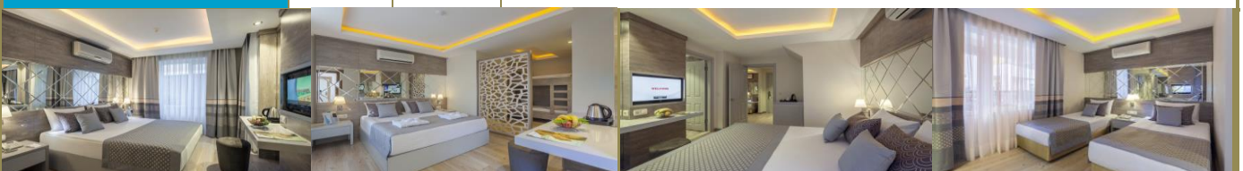
Park Villa Standard