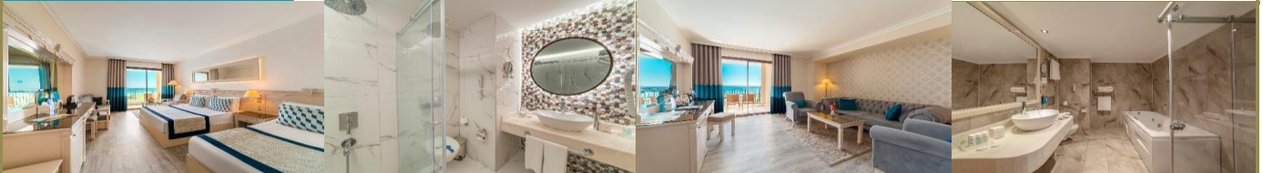
Hotel Standard (Land&Side Sea&Sea View) rooms Hotel Std Bathroom