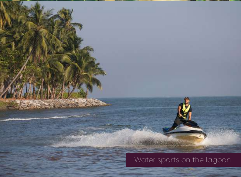
Water sports on the lagoon