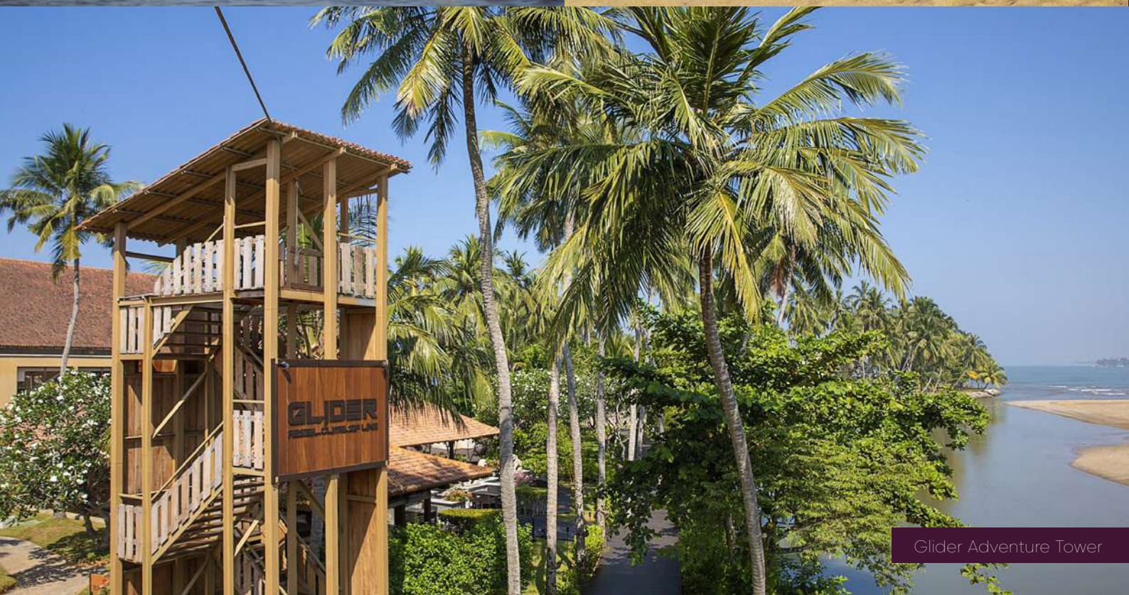
Glider Adventure Tower