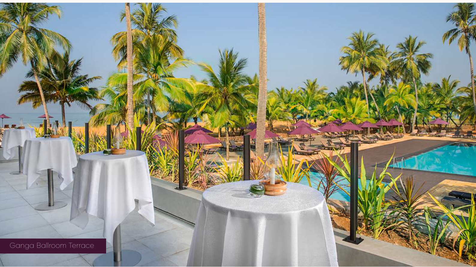
Ganga Ballroom Terrace