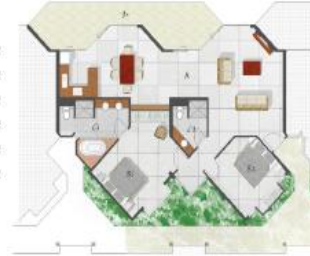
two bedroom superior residence plan (119.4 m 2 )