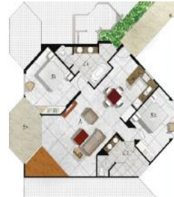
two bedroom residence plan (103.2 m 2 )