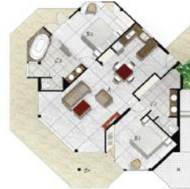
two bedroom premium residence plan (101.7 m 2 )