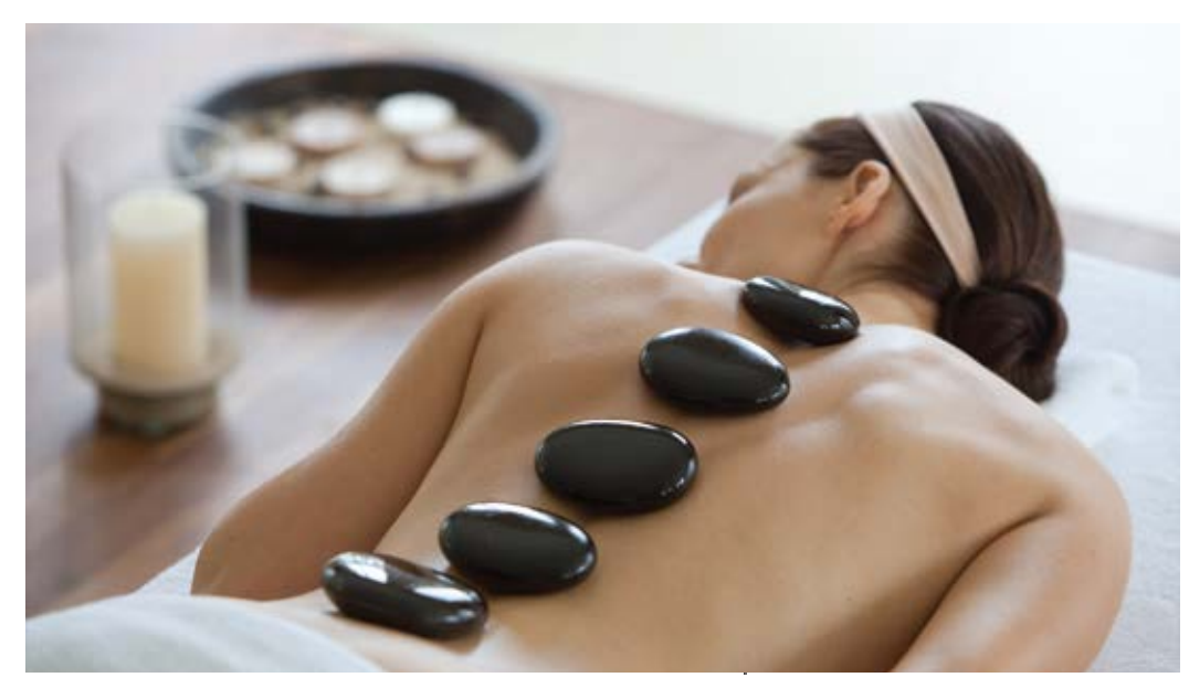
A Fitness Club is also located at the spa, and is available to all hotel guests. Wellness centre opened from 09:00 am till 07:00 pm