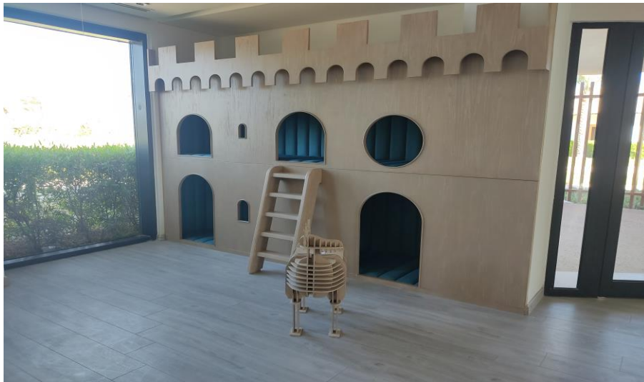
Lilac Restaurant (Main Restaurant)