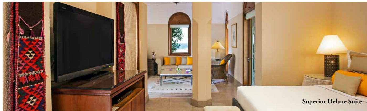
Superior Deluxe Suite