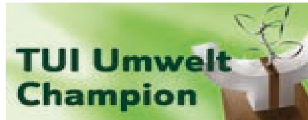
TUI – Environmentally Friendly TOP 100 Hotels Worldwide