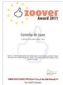
ZOOVER – BEST HOTEL BELEK