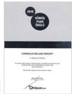
OTEL PUAN – SILVER AWARD