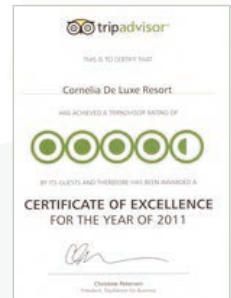
TRIPADVISOR – CERTIFICATE OF EXCELLENCE