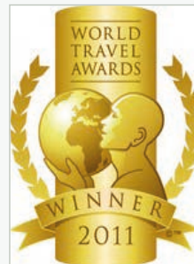
WTA – Europe's Leading Golf Resort