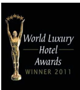
BEST LUXURY COASTAL RESORT