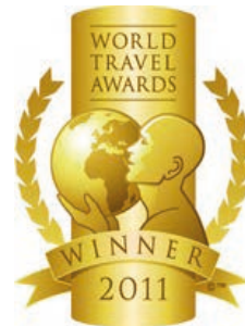
WTA – Turkey's Leading Golf Resort